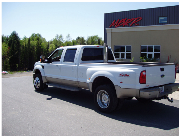
Shown with 6" X 36" Stack (B1610)

9. Check along the whole length of the exhaust system to ensure that there is adequate clearance around fuel lines, brake lines and any wiring. If any interference is detected relocate or adjust.